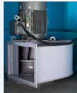
Acoustically Lined fan chamber