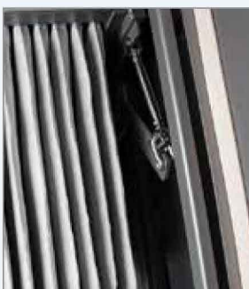
Robust Internal Cantilever