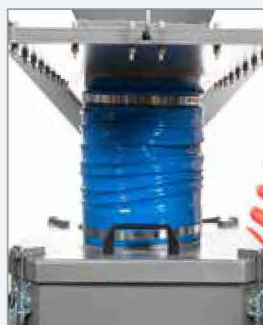
Bin Balance System