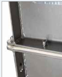
Fully Welded Construction