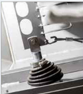
Auto Cleaning Function