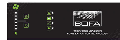
Automatic Flow Control