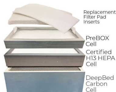
The JewelXTRACT® 3 stage filter system

The first filter stage consists of a 'dust filter box' with a replaceable media pad to capture large particles or debris, followed by a UK certified and manufactured H13 HEPA EN1822 particulate filter (with full batch traceability) to remove smoke and dust particles down to 0.3 microns to 99.95% efficiency, then a specially blended deep bed carbon filter designed to remove chemical vapours from all jewellery processes such as solder flux vapours, rhodium plating, smelting and other chemical gases. This results in a truly flexible unit with some of the best in-class 'features to cost' available in the market to date.