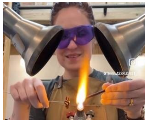
Lampworking with two nozzles