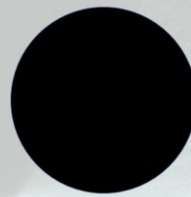
HAIR = 70-100 microns 1 micron

Particle sizes are measured in 'microns' 1 micron = 1 millionth of a metre