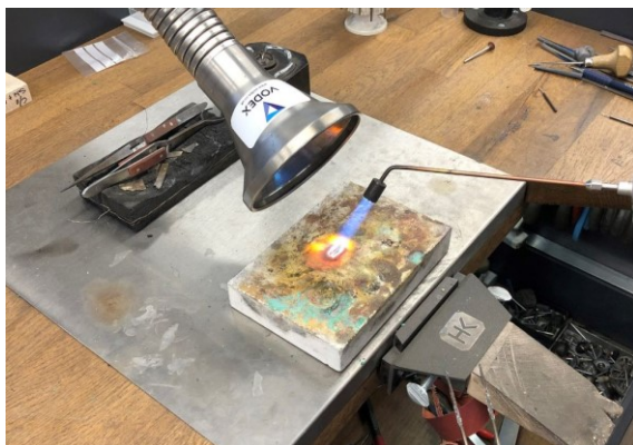
Flame/torch soldering with extraction

Lampworking involves the process of melting glass which releases arsenic (leading to arsenic poisoning). Heating up glass also releases metal fumes in the air as the colours of glass are due to transition metal impurities in the glass. When heated to molten hot temperatures, the metals are also fumed and released into the air. Heavy metal poisoning is a severe health danger associated with glass working. Any other products that you use in your glass, including enamel or leaded frit, will also add to the ventilation problems.