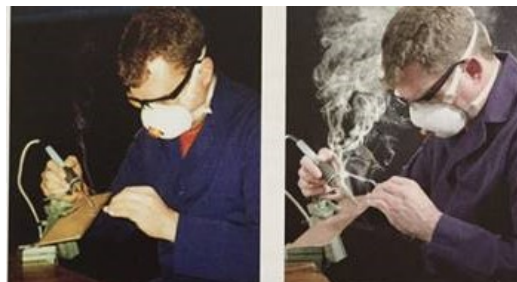
Soldering with and without Tyndall illumination

The image below shows an electronics technician soldering (this gives off a small amount of smoke that you can just see on the left image. However, the right-hand image is the same person BUT with a bright light shining on the smoke – this is ACTUALLY the same amount of smoke but it shows up the invisible smoke) – it's exactly the same for jewellery dust and fumes.