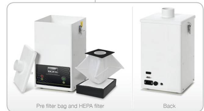
Pre filter bag and HEPA filter