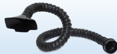
Black Arm and Rectangular Nozzle – 55mm or 75mm