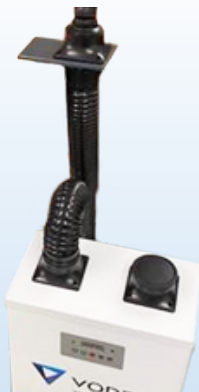
Bench Mount Kit