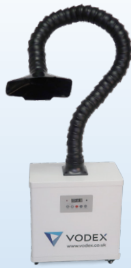
Single Inlet Unit with 75mm Black Arm and Rectangular Nozzle