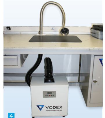
Single Inlet Unit with 40mm Stainless arm & funnel with install kit