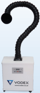
Single Inlet Unit with 75mm Black Arm and Round Nozzle