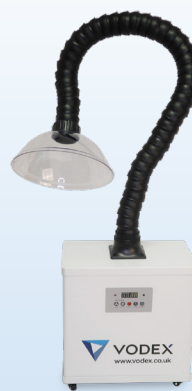
Single Inlet Unit with 75mm Black Arm and Clear Hood