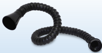
Black Arm and Round Nozzle – 55mm or 75mm